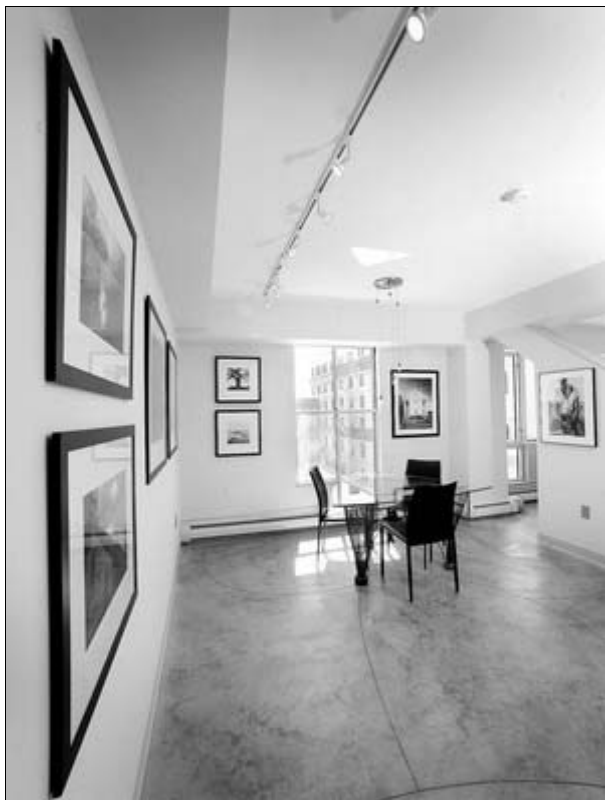
The dining room